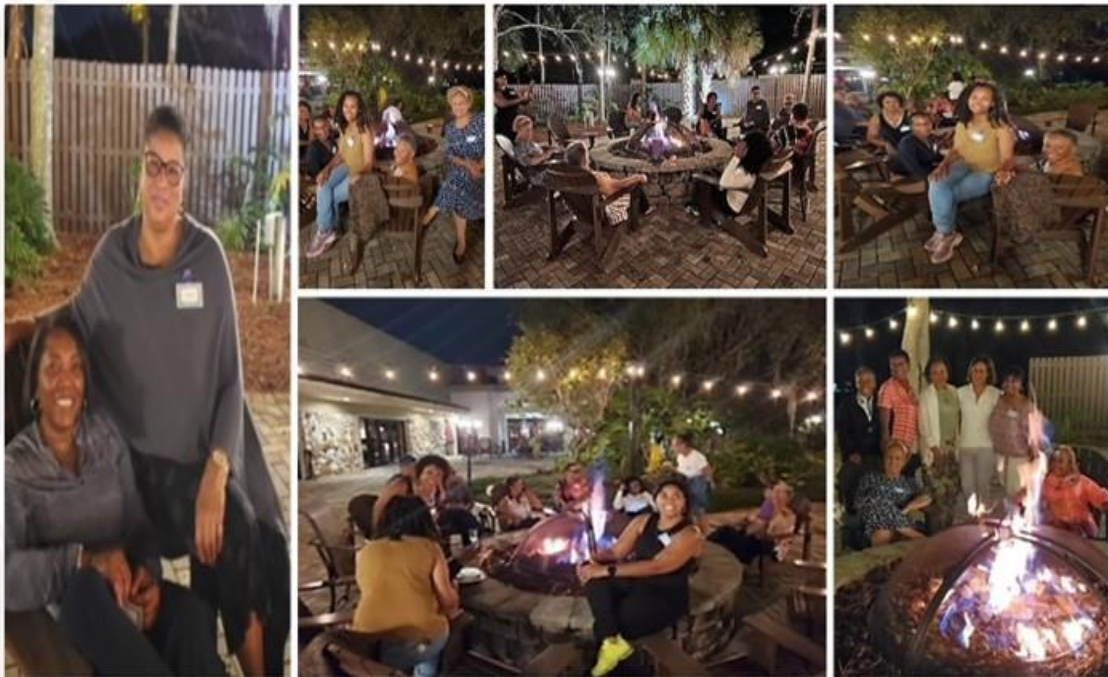
Lady's Night Out at Innisbrook Spa and Golf Resort