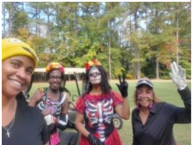
Witch Way Golf Tournament