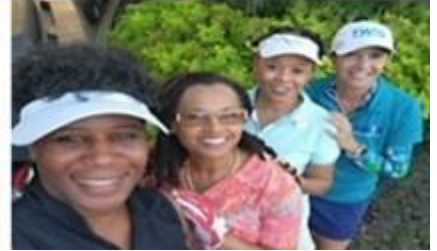
Golf Days on the Island and Copperhead Courses at Innisbrook