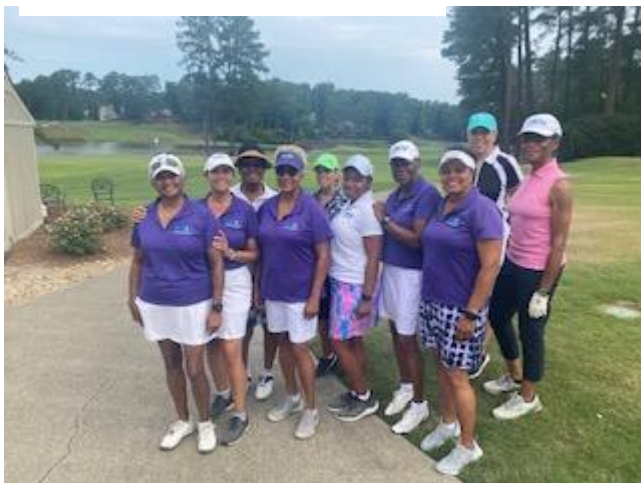
White Oak Tournament at MacGregor Downs Country Club