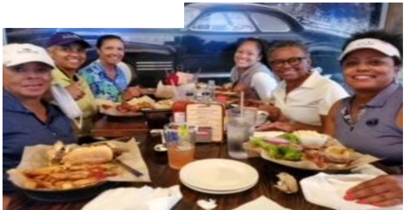
Eagle Ridge League Play 19th Hole