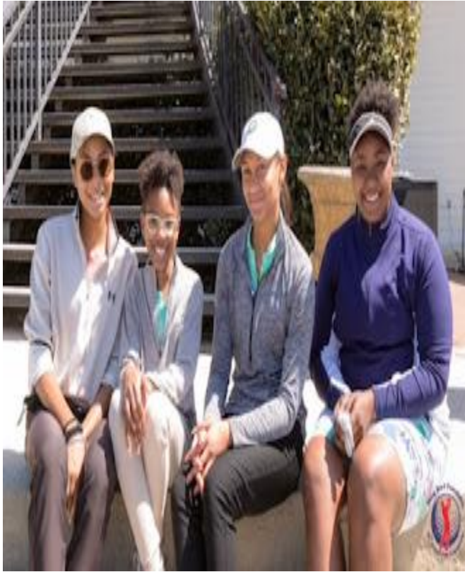
"TWIG Kidz, a program of the Triangle Women in Golf Foundation, Inc., introduces young women (ages 6-18) with the intention of inspiring them to continue playing the game."