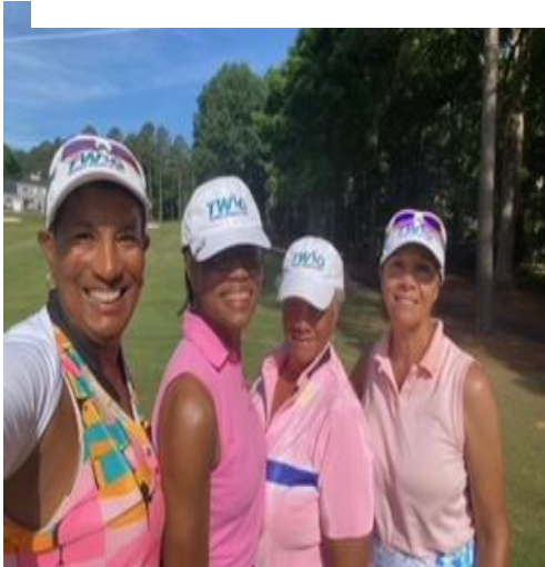
Prestonwood Country Club Tournament