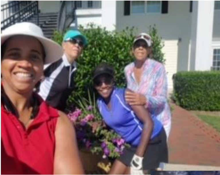
Doug Boyd Tournament at River Ridge