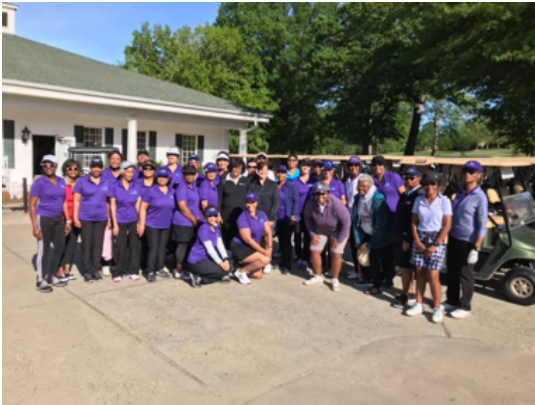
TWIG members well represented in purple in group photo