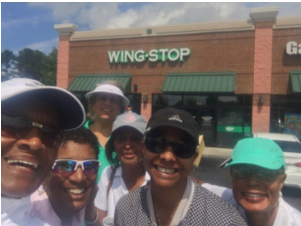
Lunch after Thursday league play at Hedingham on June 14th