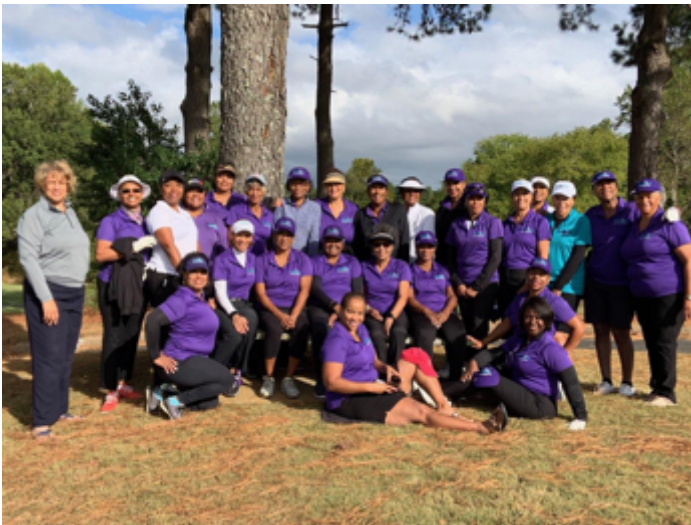
Smiling faces at well attended Fall Trip at Kingsmill Resort