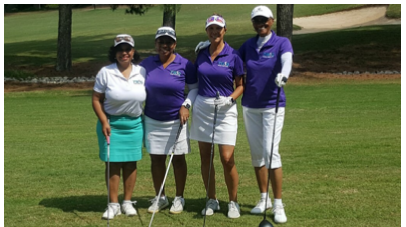
Strongest participation for the season at Wildwood Green on June 4th