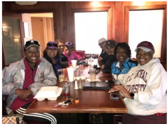
Enjoying drinks, fun and fellowship at the 10 th hole