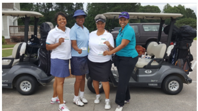
Saturday league play at Zebulon Country Club on June 23rd