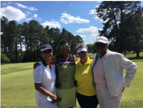
Thursday league play at Wil-Mar on May 16th