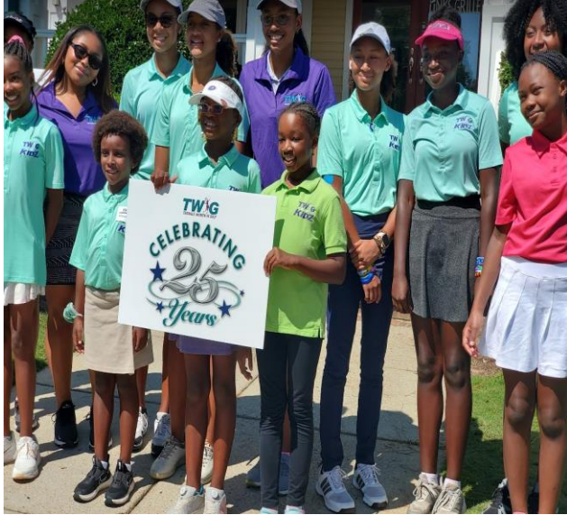
TWIG Kidz supporting the TWIG 19th Invitational