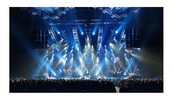
Venues / Entertainment Halls, Venues, Shows, Theaters, Cinemas, and Events.