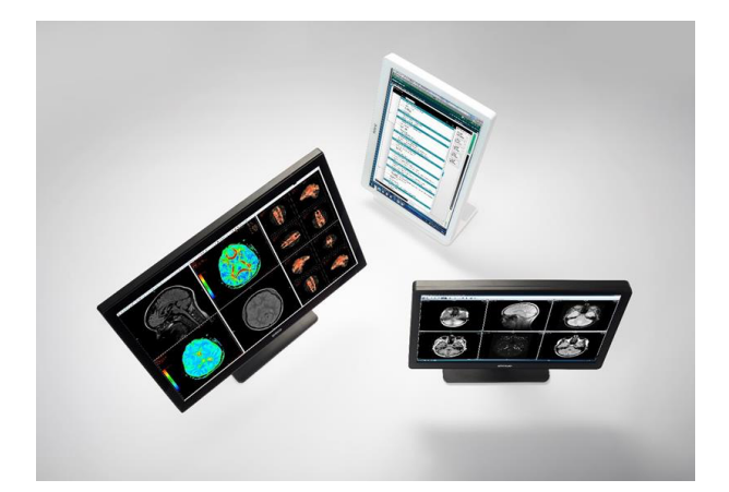
Medical Display Systems