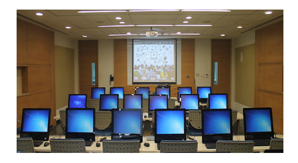
Education / Training Schools, Universities, and Educational Centers.