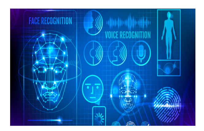
Biometric Data Acquisition