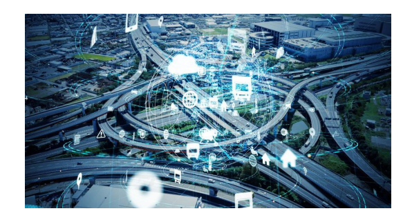
Utilities / Transportation Train Stations, Bus Stations, Trucking Stations, and more.