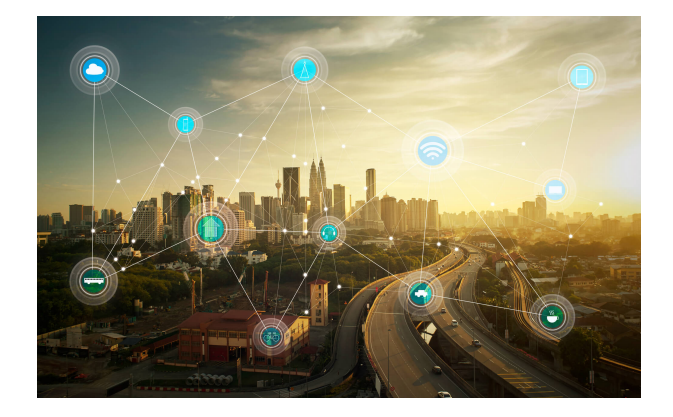
Safe City Components