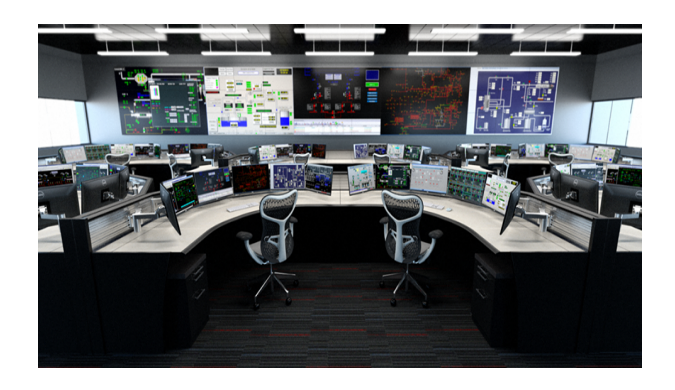
Command and Control Rooms