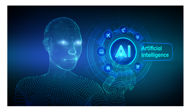
Artificial Intelligence (AI)