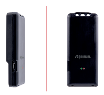
Dimensions: 93 x 41 x 15 mm