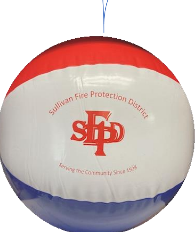
Have Fun this summer and be safe!