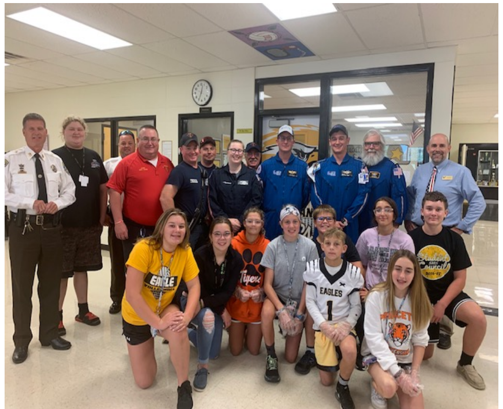
First Responders and Sullivan Middle School at Patriot Day Luncheon