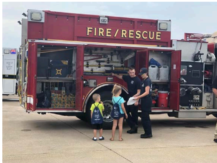
Fire prevention 2019

Fire Prevention month has started with the kiddos, below are some of the pictures we have collected in the month of September.