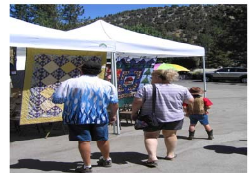
Auction photos by Beth Stanton.