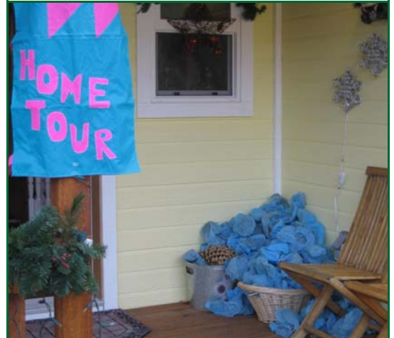
Piles of hospital booties on the porch of the Zuber Home, used to keep the floors shiny and the carpets clean with 500 visitors pressing in throughout the day.

An outstanding community effort for a small town of three thousand habitants!!