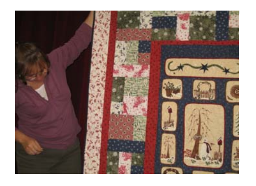
Another UFO out of the closet and finished by Christy Close. The back had lots of interest too.