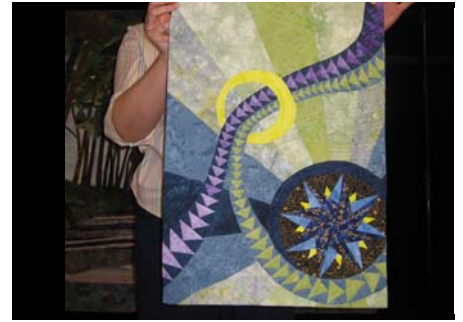
Beth finished this completely original design in two classes at Road to California with Gail Gerber.