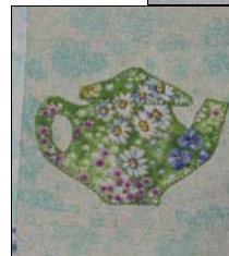
The oriental tea pot above is on a 12" block, and the hand blanket stitched pot to the left is 6".