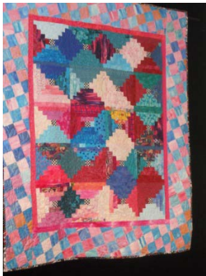
Some Eye Candy