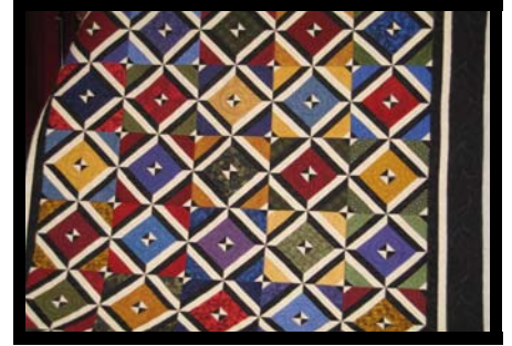
Ginger Wheeler made this dazzling stained glass window from her own design.