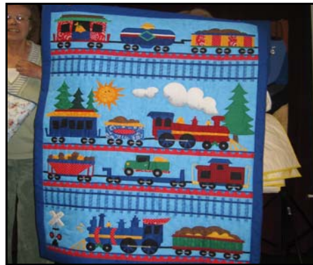
Someone behind this quilt finished it in two hours. Cute fabric.