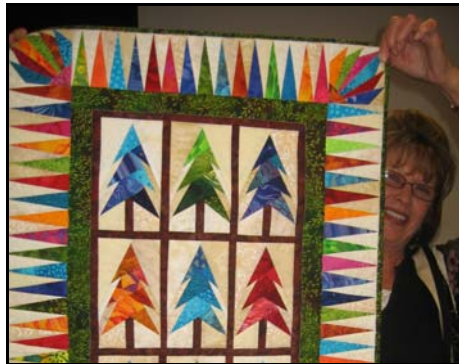
This is Rose's recuperation quilt—nice recovery!