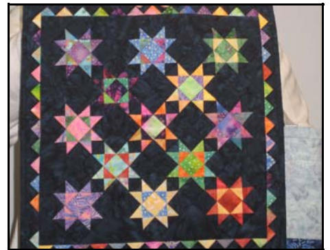
Beth can't remember why she wanted to do a miniature quilt, but it is a stunner!