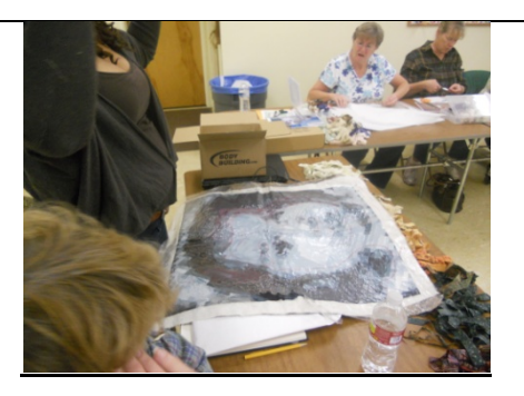
Start with a photo