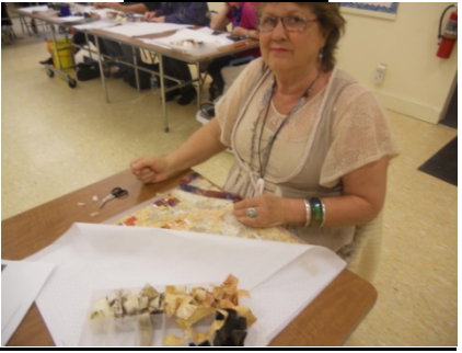
Use the grid and add fabric pieces to it.