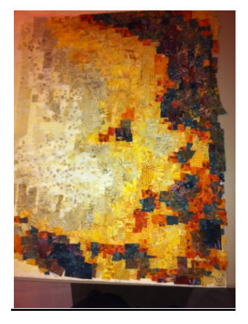
You'll end up with a lovely fabric Photo