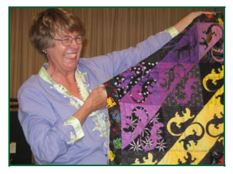
The first quilt to come out of our Friendship block program—Gyrating Geckos, used for the back of a mola quilt.