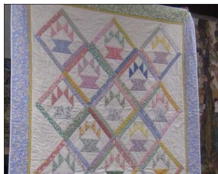
This hidden quilter made a vintage looking flower basket.