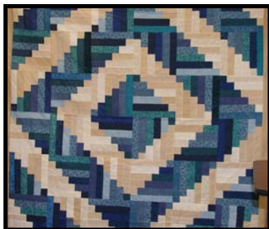
Another finished Wood Pile by Carol Poisal. Speedy gal!