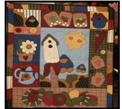
I think these finger tips looks like Icky Orr's. We'll see in the auction.