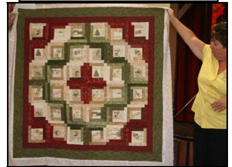
The Material Girls put this log cabin together for the auction—nice combination.