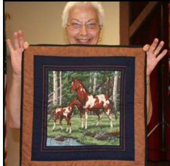
Fran Ouimette's horse panel should just suit a little horse-loving girl at the auction.