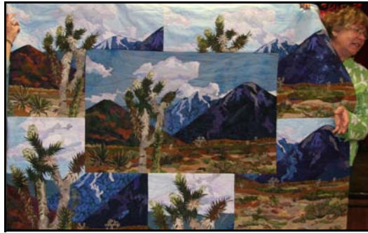
Carolyn Villars took the pattern for the Wrightwood Historical society and added 5 more sections, making a fractured landscape design.