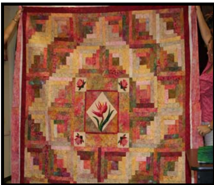
Spectacular Bird of Paradise by Rose Burcher. Is that a Wood Pile behind the flowers?