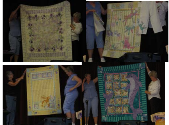
More lovely quilts!