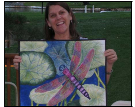
Skillful quilting lines in this dragonfly closeup by Lorrie Havens.