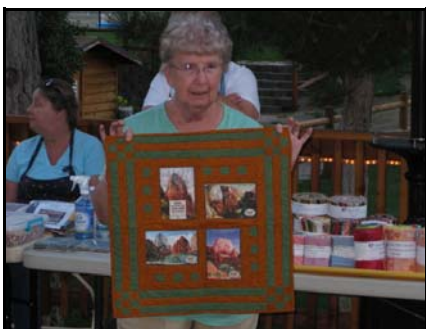
Printed photographs assembled by Harriet McGlothlin.