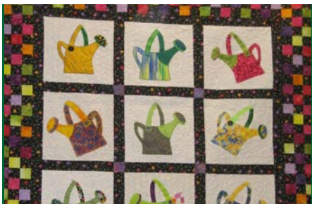
Beth Stanton put together these watering cans from another set of friendship blocks. Fun colors!