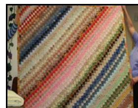
This postage stamp quilt was made for a US Post Office man.