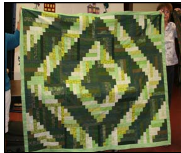
Leonor Ferris made a green version of Wood Pile.