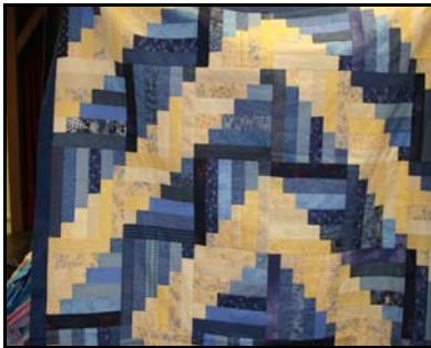
Another mysterious quilter is holding up her quilt, but no one can tell me who this is.