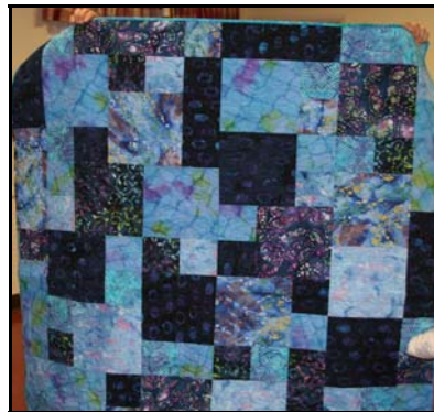
This simple and fun design was also finished and quilted by Christy Close.