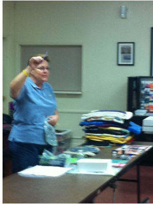
"Less Than Traditional"