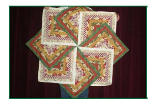
Another table centerpiece which Flo saw and then drafted the design for herself. A striking design.