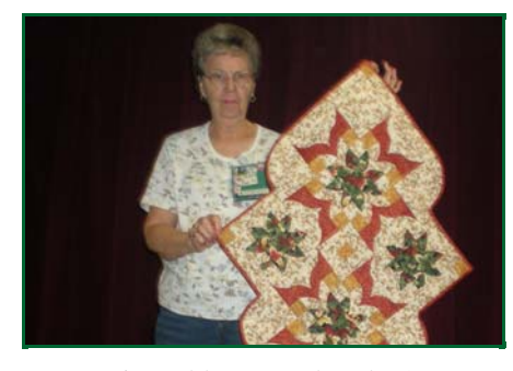
A stunning table runner by Flo Souza.