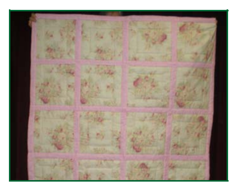
Today's mystery quilt is brought to you by—is that you Flo?