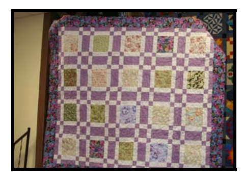
Flo Souza brought in 2 quilts for the kids at Cancer Camp. Nancy Fogo was amazed to have 110 quilts ready!