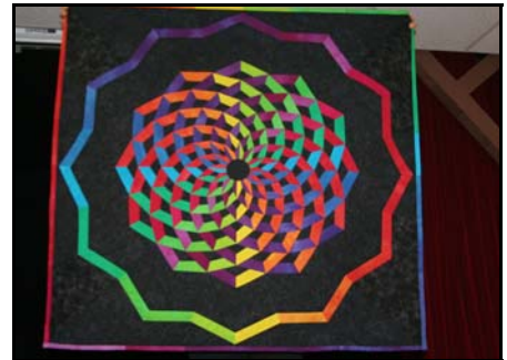
Cathy Miller's Bella Bella quilt done in a set of graduated hand dyes.