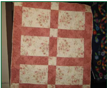
A bouquet of roses from the charity fabrics, assembled by Darlene Packard.