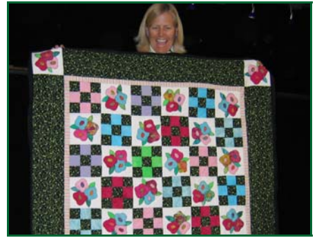
Laura Greene with more flowers and a nine patch design..