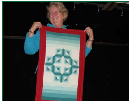
Holiday table runner with tiny log cabin cuts, Marion Hall again.