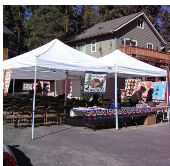
Setting up for the 2011 auction.

Each year the guild holds a quilt auction during Wrightwood's Mountaineer Days where small quilts donated by members are sold to the highest bidder. This is the first of the guild's two major