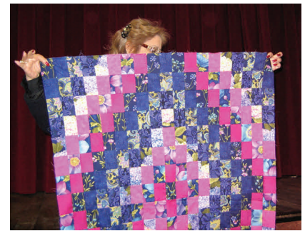
Two above: Lorraine Halverson displays her graphic Asian influenced quilt top and a pink and purple "Around the World" top.