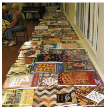
"Garage Sale" fabrics and books were displayed on tables prior to the sale.

Members attending the September meeting were treated to tips on machine care from sewing machine repairman Dave Binnquist and were able to purchase great fabric and books from