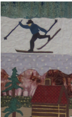
Detail of a Strippers' row robin quilt that was shown on the tour