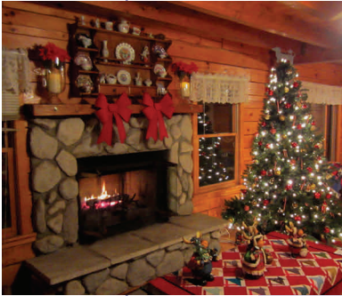
The Conifer house was the perfect setting for a mountain Christmas

Next meeting is January 8 at 6:30pm. Bring: