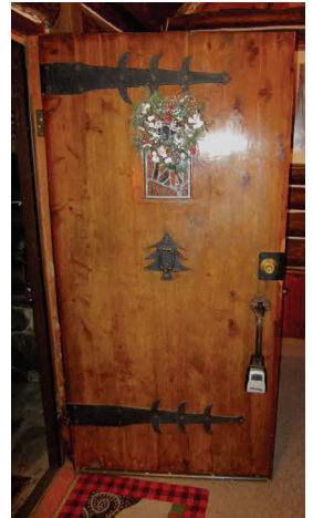
Rustic door at the Edna home tour house.