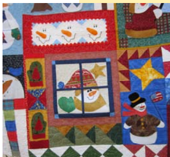
Detail of the Strippers' auction quilt