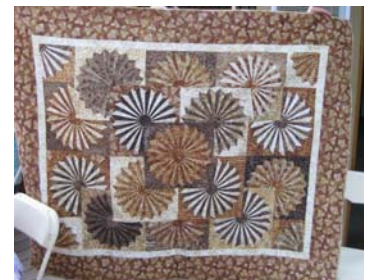
Sample of the pattern by Anelie Belden that will be made at the August 14 workshop.

Anelie is also conducting a workshop for