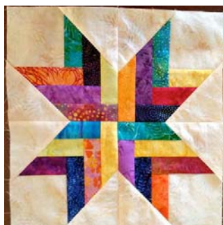
Sample of the bright batiks used in the next opportunity quilt.

A few guild members brought batiks for the opportunity quilt, but we need a lot more. Please bring one or two fat quarters of bright batiks to the December meeting so the quilt can be really scrappy. Please pre-wash all the