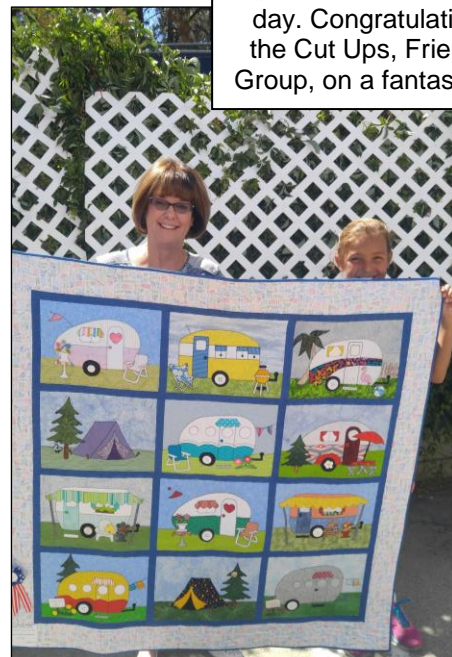
The top quilt bid went for $500! What an exciting day. Congratulations to the Cut Ups, Friendship Group, on a fantastic quilt.