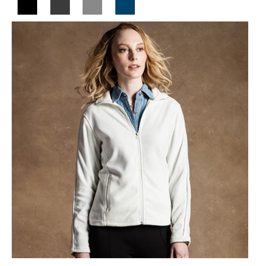
5301SP Women's Micro Fleece Jacket