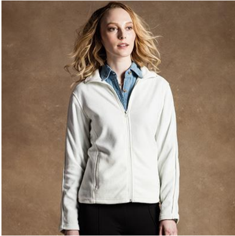
5301SP Women's Micro Fleece Jacket