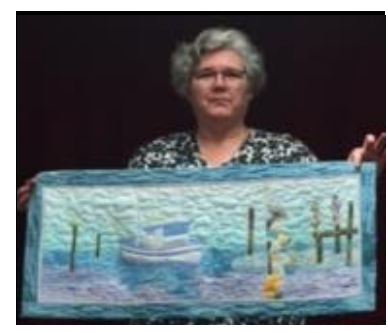
Seen at the County Fair