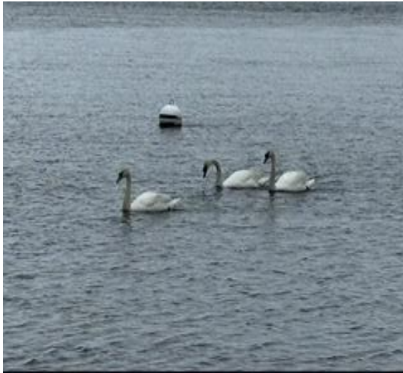
Hartford Avenue beach swans.

Here is the picture of the swans I saw on May 21 off the Hartford Avenue beach. I am just beginning to learn more about our shoreline birds so I am trying to determine the exact kind of swan. My sister-in-law is an experienced birder and thinks they are immature mute swans due to their size, "S-shaped" neck and knob on the bill. Immature mute swans have not yet developed the typical orange bill seen in adults. She also checked her local internet sightings and mute swans have been seen in South Cove and North Cove. Another birder friend took a quick look and thought they could be trumpeter swans. However, my sister-in-law said trumpeter swans would be a rare sight in our area.