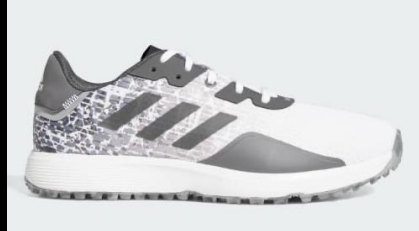
$100 ADIDAS S2G SL