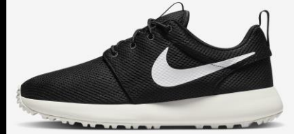
$85 NIKE ROSHE G