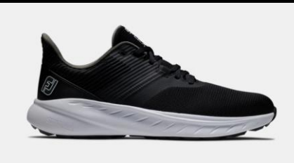
$100 FOOTJOY FLEX