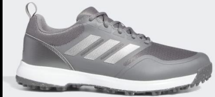
$70 ADIDAS TECH RESPONSE