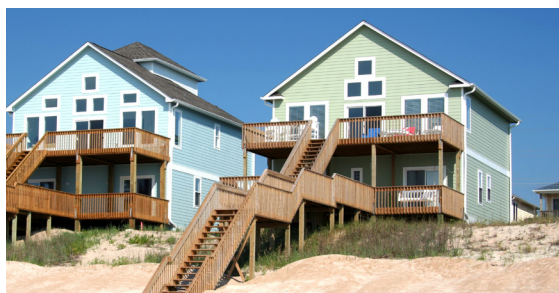
Quaint Beach Bungalow