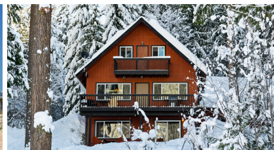
Cozy Mountain Chalet

Hire Hot Shoe Pix , a Matterport Photographer, to scan your property today!