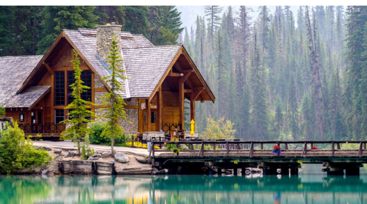
Serene Lakefront Cabin