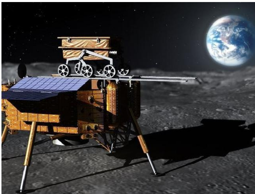
Pictured: A digital rendering of the Chang'e 4 spacecraft on the moon

In addition, the planned landing site of the Chang'e-4 is projected to contain potential frozen water craters, indicating the possibility of sustaining life on the moon. This new rocket will collect samples that could then be preserved for future analysis when new research tools are invented. China's new mission will surely awaken the world to the rewards of exploring space, now and in years to come.