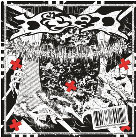
The album cover of Anonymized Internal Criminals

An underground band hailing from the bustling New York punk scene, which has produced acts like Turnstile and The Voidz, Died blows its competition away. Some of the album's tracks sound like they could have been recorded by post-hardcore band At the Drive-in during their prime. Every musician in this group has a lot of talent, demonstrated by the band's ability to pack so much aggression and virtuosity into just 20 minutes. Plus, the cover art is amazing.