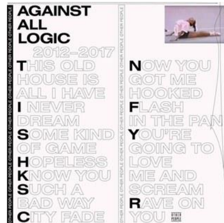
The album cover of 2012-2017

I have many qualms with house music. It's usually overly repetitive, and feels stale. However, Nicolas Jaar, switching from his usual genre of spooky ambient house, recognizes these follies and combines cut-up soul, disco, and funk songs with house beats, electronic interludes, and other drum samples. It feels like a combination of Burial's depressive ambient techno masterpiece, Untrue , and The Avalanches' plunderphonic Since I Left You , but with a heaping teaspoon of funk added.