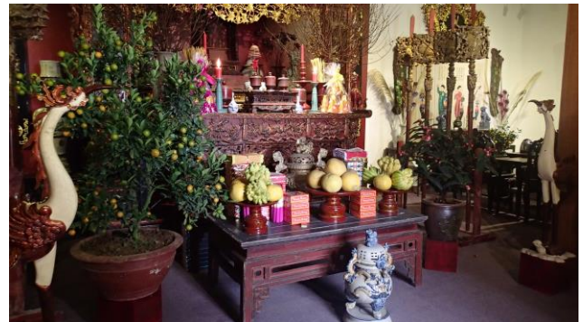
Pictured: An altar honoring ancestors during Tet Nguyen Dan

Celebrated in Vietnam, Tet Nguyen Dan is similar to the Chinese Lunar New Year, as it also celebrates the beginning of the next Lunar year. However, Tet Nguyen Dan is celebrated for seven to nine days, during which people visit the temples of their ancestors and pray for a better year. They also often return to their homeland to visit an ancestor’s grave or to be with their family. This year, Tet Nguyen Dan will also fall on February 5 th .