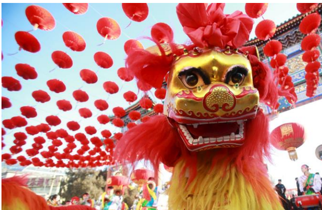
Pictured: A common depiction of the monster Nian

According to legend, each year, Nian would go through towns, destroying everything in sight. One year, a beggar arrived in a small village just as the residents were leaving. The beggar claimed that he could make the monster go away, and put up red decorations and readied firecrackers. When the monster arrived in the town, the red decorations and firecrackers scared him, forcing him to run away from the town. After returning, the villagers were amazed, so each year, the villagers put up red decorations and lit firecrackers on the Lunar New Year.