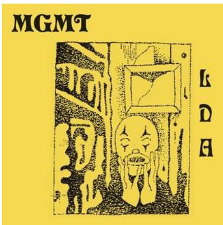
The album cover for Little Dark Age

MGMT has an uncanny ability to bring retro nostalgia for the 80's to a psychedelic, new wave pop album without sounding dated. Though fans believed the band would not be able to reach the same high quality as their debut albums, MGMT proved those worries wrong, putting out what is arguably their best album yet. The groovy, yet atmospheric structure of their production creates an unique sound that ultimately cements their work as an critical release.