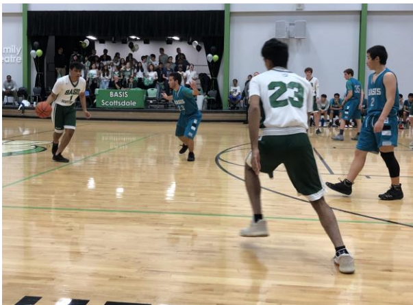
Pictured: BASIS's varsity team in action during the game

Overall, the first weekend following Winter Break definitely stood out for our school this year. While our school may not have a traditional football Homecoming, our Hoopcoming game has remained a tradition in BASIS for many years and our most popular sports event of the school year. Even though the Hoopcoming Dance is a new event, it may become a new BASIS tradition considering the success of this last dance. Let's give a final congratulations to our new Homecoming Kings and Queens and our JV and varsity wins!