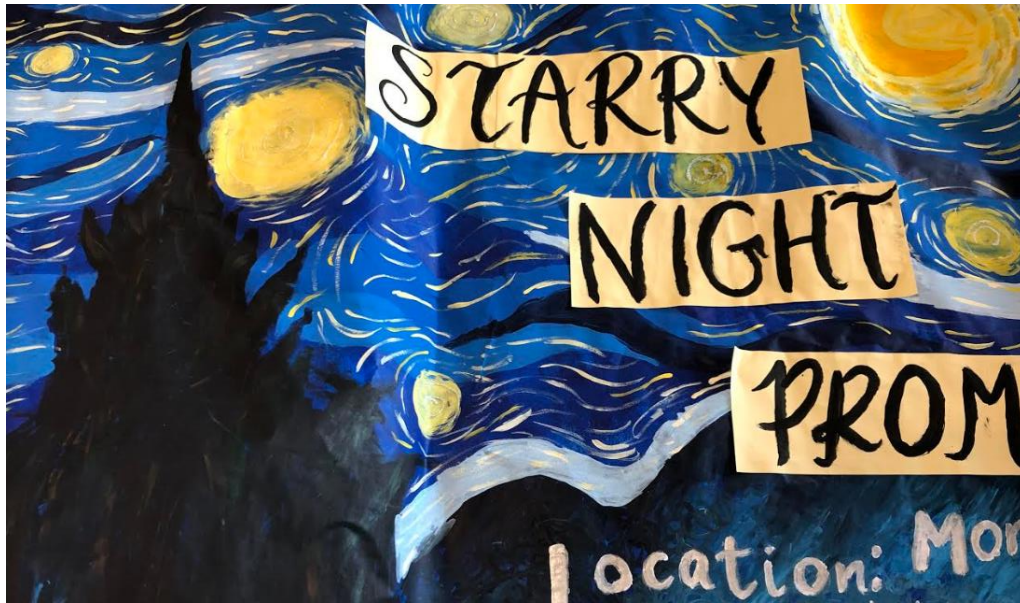
A picture of the 2019 prom poster created by the BASIS Leadership Dance Committee

BASIS Leadership recently organized prom for this year's sophomore, junior, and senior classes at Monterra at Westworld on April 13 from 7pm to 11pm. Stemming from the theme of Van Gogh's famous painting Starry Night , there was a blue-and-white color scheme with lights, streamers, and balloons lining the halls and tables, as well a backdrop behind the DJ with a copy of the iconic painting itself. While last year's venue at Chateau Luxe was a sizable distance from most students, and the room was too large for BASIS