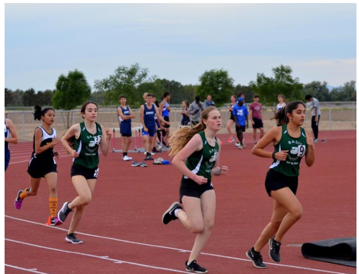
Pictured: BASIS Scottsdale track team participating in the girls' 1600 race