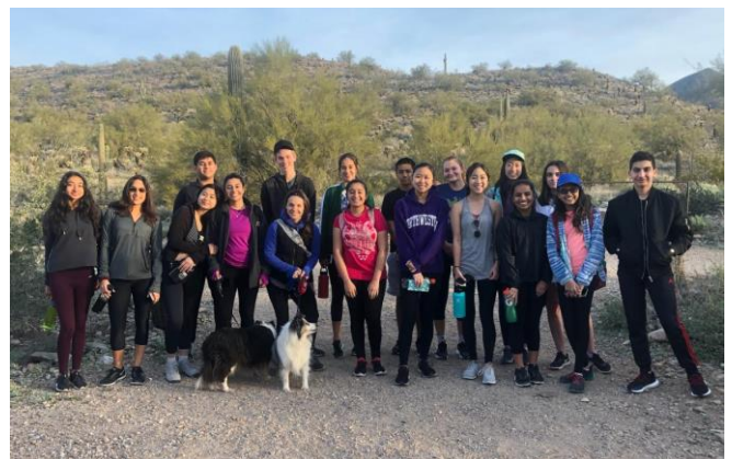
Pictured: She's the First members on their #SweatforSTF hike in January 2019

Each dollar She's the First raised has contributed to aiding girls education in underprivileged countries – an impact which She's the First was able to tangibly understand through direct letters of correspondence in this past year. Its contributions toward combating gender inequality make it an invaluable part of the BASIS community, and provide exciting hope for the future. If you want to make global change in the fight for gender equality, try out She's the First as an extracurricular activity next school year.