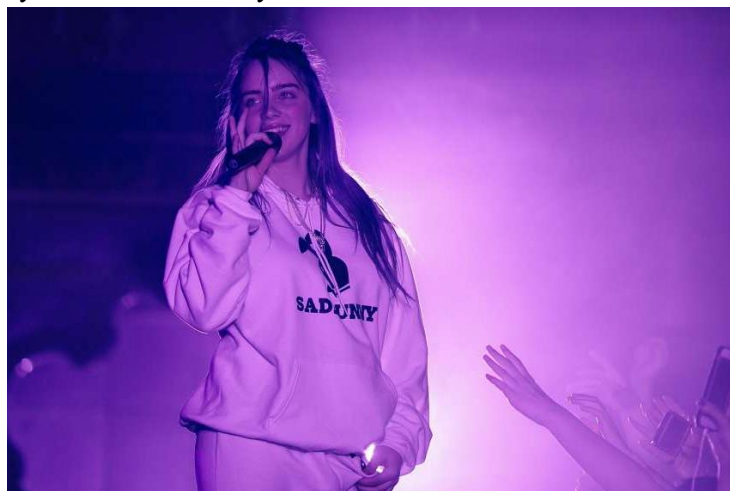
Pictured: Billie Eilish performing in San Francisco in 2018

Despite this recent controversy, Eilish is steadily becoming a household name, with the success of WHEN WE ALL FALL ASLEEP, WHERE DO WE GO? causing Eilish to become the first musical artist born sometime in the 2000s to have a number one album. If you enjoy alternative music, this album might be the perfect listen for you.