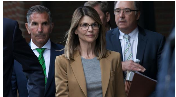
Pictured: Actress Lori Laughlin after being accused in the recent college admissions scandal

Now, in the wake of these accusations, it becomes all too clear that although these actions were extreme and devious, they merely scratch the surface of how many students gain acceptance into select universities through alternative, legal forms of bribery. Exposing the reality of college admissions makes one wonder just how much of college admissions are determined by absolute luck of environment, rather than merit alone. Even in BASIS, the repercussions of these accusations impact the way students look towards college acceptances. BASIS pushes each child to succeed in testing and academic activities, so if the colleges no longer care about merit, then what was the point of the stress from these last eight years? Nonetheless, there is only so far that a person can pull off such large-scale fraud in the long-term, and the great skills we learn BASIS will serve us better than a fake ride for the crew team.