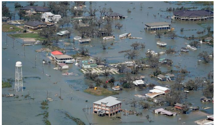
Damage caused by Hurricane Laura

Given that hurricane season usually ends around the end of November, it is likely that scientists will have to resort to using Greek letters for this year's tropical storm names, which has not happened since 2005. In terms of the sheer number of hurricanes, 2020 has proven to be one of, if not the worst tropical storm seasons in history. Coupled with the pandemic, many are finding it difficult to evacuate. The hurricanes, along with the forest fires ravaging the west coast, are two distinct catastrophes demonstrating the effects of global climate change, which must be addressed quickly to mitigate the increasingly disastrous damage.