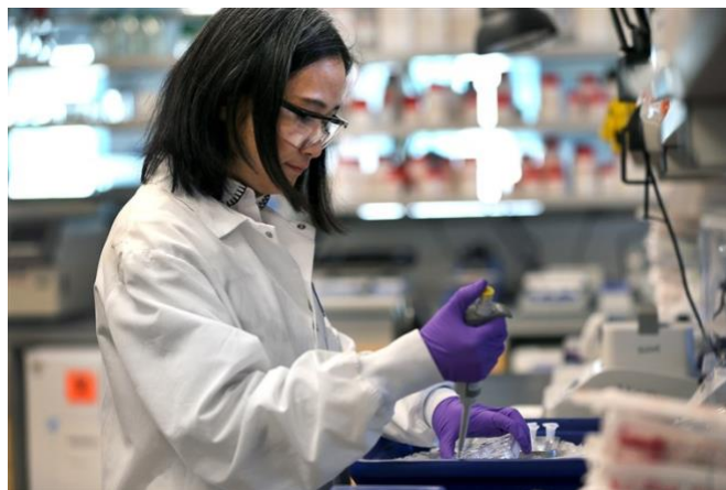
Scientist working in a Moderna lab on Feb. 28, 2020

Unfortunately, researchers simply do not have all the information to fairly assess when a vaccine will be approved for the public. But, with the majority of estimations centering around some time in 2021, it seems that the focus for now should be on remembering to wear masks, staying optimistic, and not forgetting to sign in through SPORK.