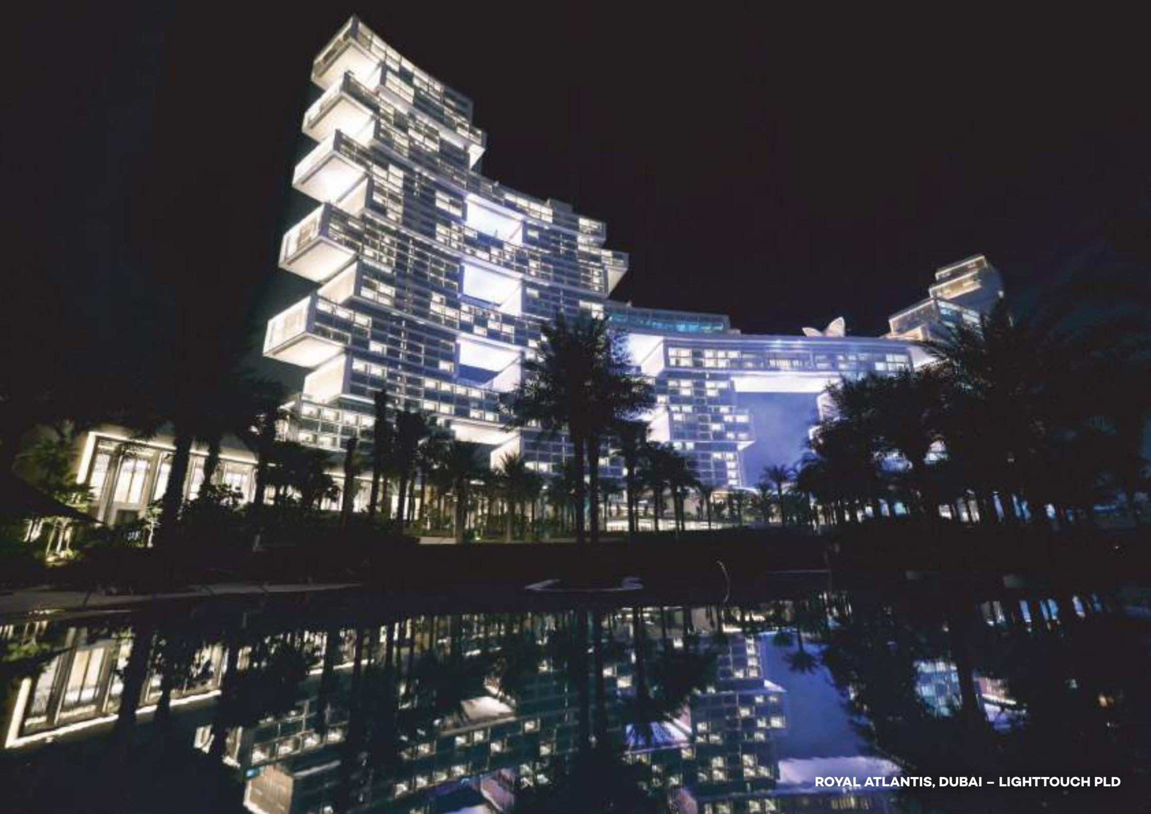
ROYAL ATLANTIS, DUBAI – LIGHTTOUCH PLD