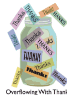
Overflowing With Thanks

Keep sending in your donations for the Salvation Army Food Pantry. Every little bit helps!