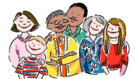
Mother & Child Event

Please complete the interest form included in the bulletin.