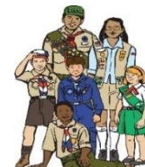
Saluting Our Scouts