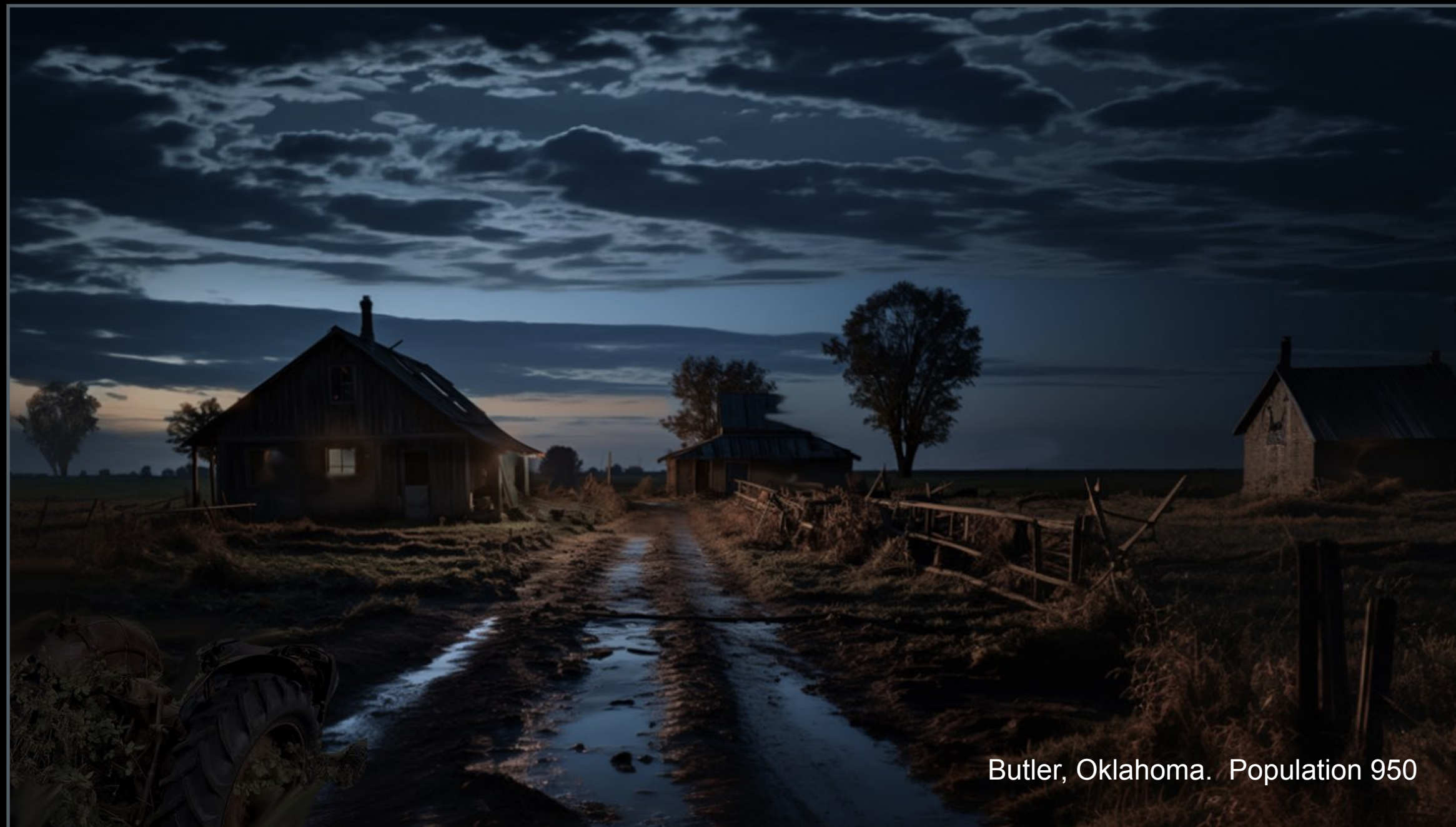
Butler, Oklahoma. Population 950