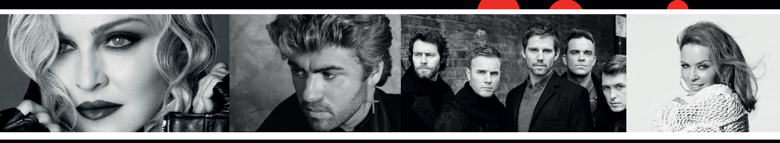
by the Biggest Artists