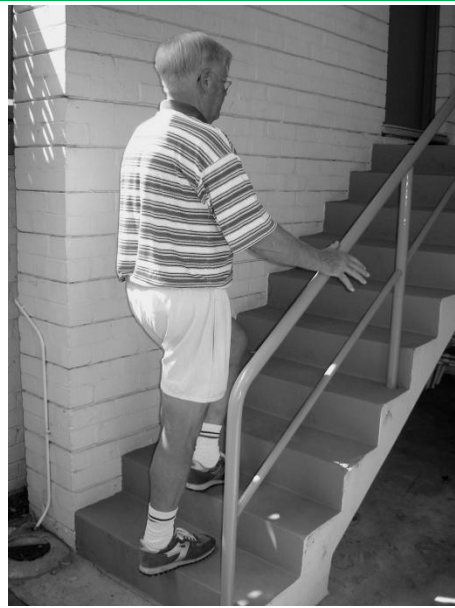
Light support – using less hand support on the hand rail