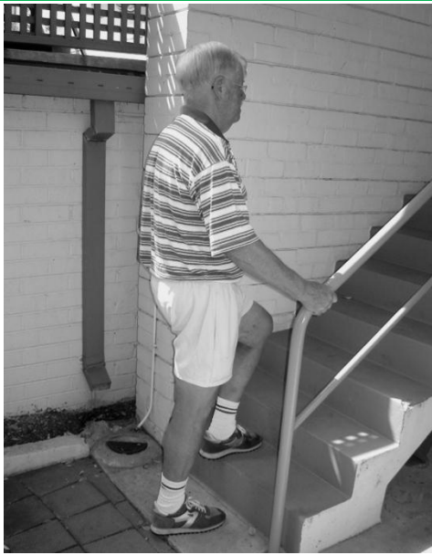
Firm support – holding on tightly to the rail