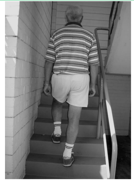
Going up steps using NO hand support